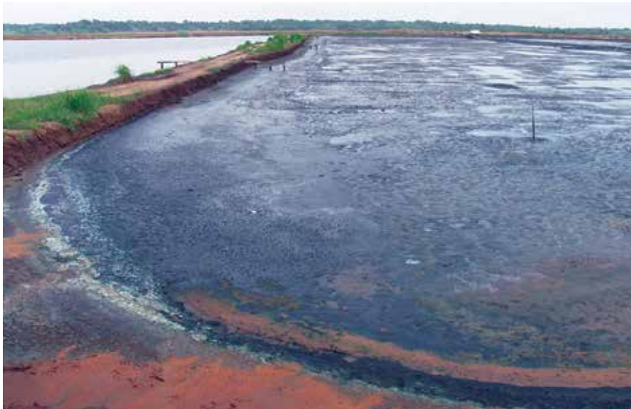
Pond bottom soil should be sampled from multiple areas and combined in a composite sample for testing. Tilling can help the soil dry more quickly.