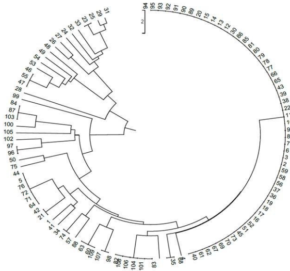
Figure 3. Phenetic UPGMA tree obtained by the 10 SSR markers based on Cavalli-Sforza chord distance (1967), showing the genetic relationships among the 109 accessions of the jatropa germplasm bank at the University of Florida. The edge numbers represent each accession as presented in Table 1.

The phenetic tree of the 109 accessions based on the UPGMA (Figure 3), confirmed the grouping pattern reported in the PCoA. The dendrogram showed clear separation of the Costa Rican and Mexican accessions from the rest of the accessions, as presented in the PCoA (Figure 2), and showed a higher level of diversity than the accessions from other countries.