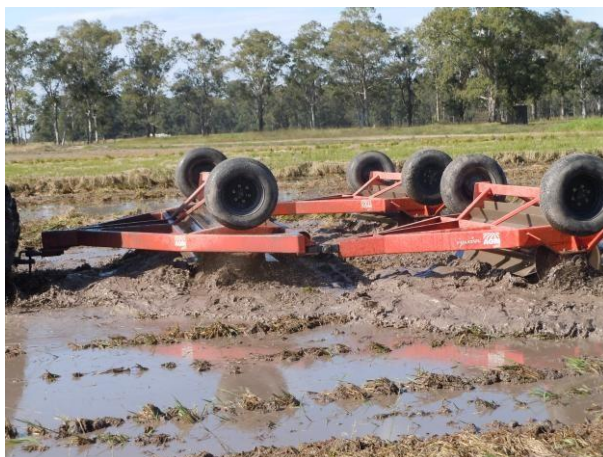
Figure 1. The set of knife rollers in Lowland Experimental Station of Embrapa Temperate Agriculture (Capão do Leão, Rio Grande do Sul).