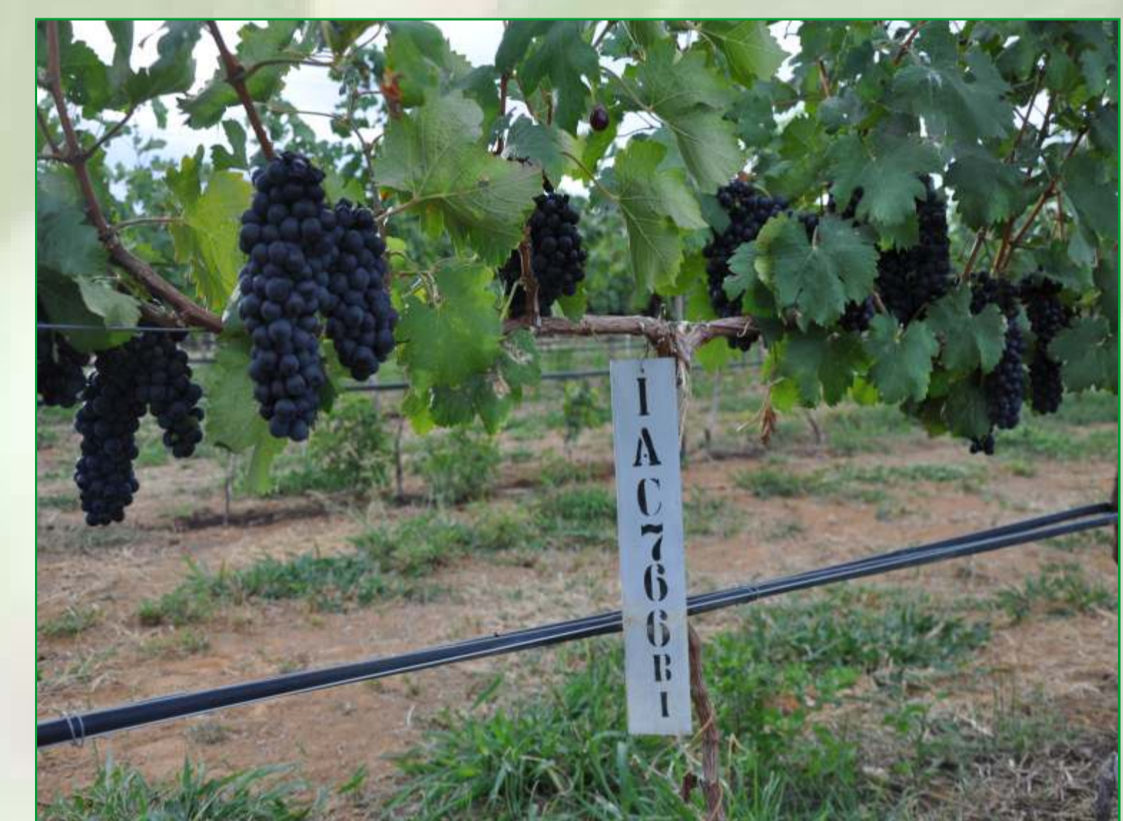
Figure 3. 'Syrah' grafted on 'IAC 766' rootstock at harvesting, Petrolina, PE, 2015.