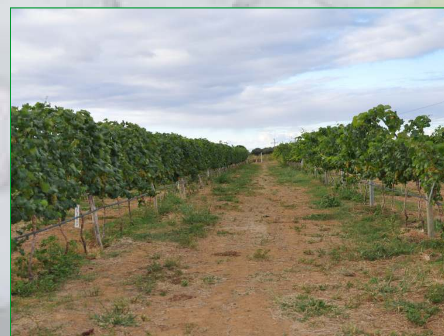
Figure 2. Experimental vineyard of 'Syrah', Petrolina, PE, 2015.