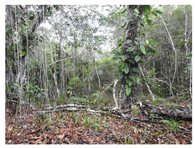
Figure 2. Orchid Liparis nervosa on earth growth conditions

At the forest that surrounds the rocky hill it was observed, associated to small trees, the following epiphytes orchids: Dimerandra emarginata, Octomeria sp., Scaphyglottis sickii, Trigonidium acuminatum and Cattleya violacea. The frequency of these species was very low in the area studied. At the forest covering the base of the mountain it was found the larger number of