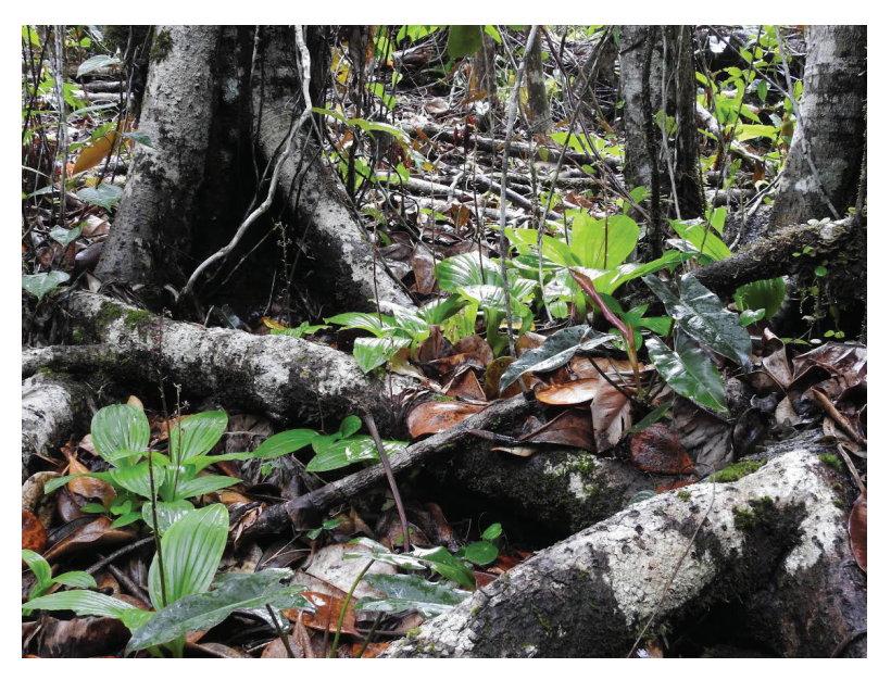
Figure 3. Orchids Oncidium orthostate in the natural environment

species (13), with predominance of epiphytes. Besides that, the frequency of these species was very low, except for, Camaridium ochroleucum and Heterotaxis superflua that were found in larger quantity associated to some sort of trees. The specie Liparis nervosa (Figure 3) was found only associated to the base of a unique tree, over the organic matter accumulated locally.