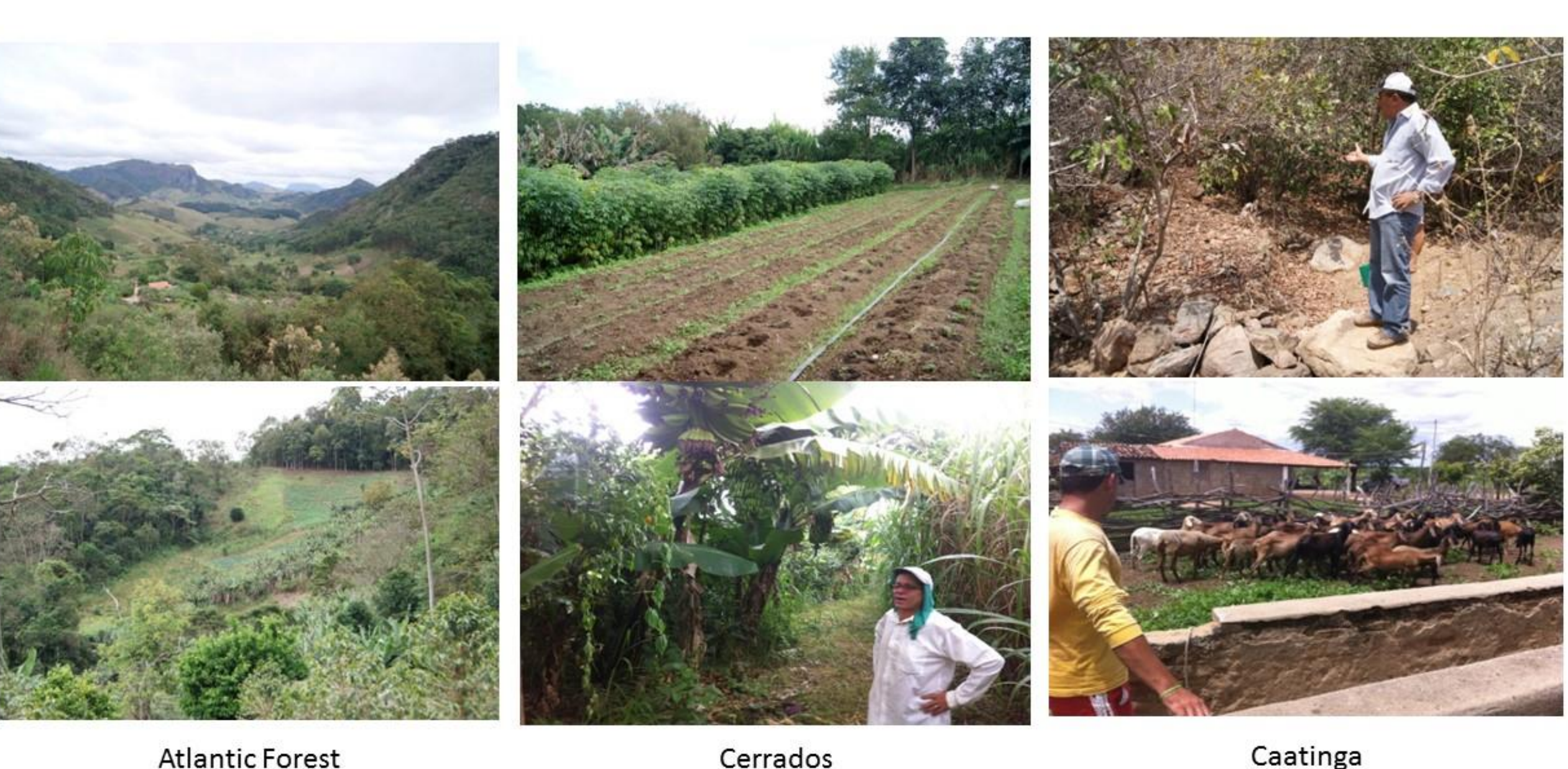
Figure 1: Brazilian biomes and some aspects from the study area.