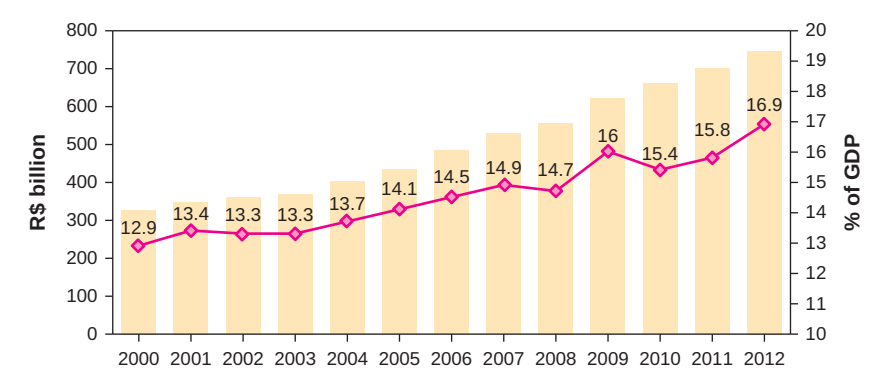
Figure 1 Growth in social spending in the Federal Government budget of Brazil in R$ billion at 2012 prices and as percentage of GDP

The rural pension system in Brazil has been universal since the first half of the 1990s. It consists of the payment of a monthly cash allowance of at least one official minimum wage to elderly male and female family farmers. In terms of coverage, in 2012, the system paid 8.5 million pensions totalling R$ 60.9 billion, half of which benefited family farmers in peripheral areas of the north-eastern region, which perform the worst in Brazil's social indicators (Silveira 2016).