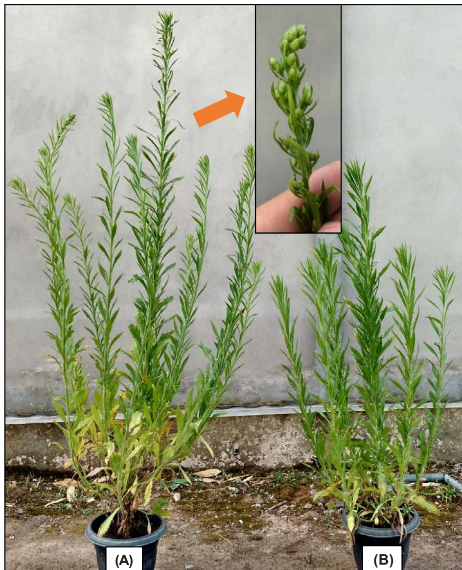
(A) Plants at the early reproductive stage (detail: formation of reproductive structures); (B) Plants at the vegetative stage.

The greenhouse experiment was conducted in a completely randomized design with four replicates. Treatments consisted of two glyphosate doses (0 and 1,480 g a.e. ha -1 ; Roundup Original DI 370 g a.e. L -1 ; Monsanto) applied on hairy fleabane plants at the vegetative stage (30 days before the reproductive stage – plants at 1.10 m in height) and at the early reproductive stage (beginning of reproductive structure formation; plants at 1.40 m in height) (Figure 1).