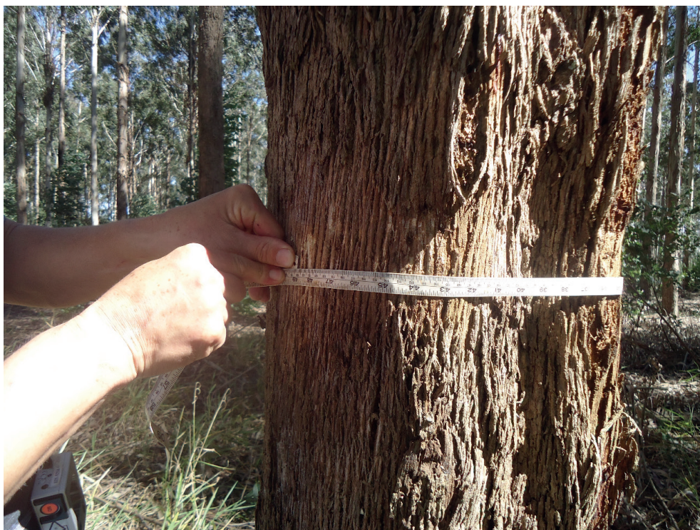
Figure 1. Measurement of diameter at breast height (DBH) of eucalyptus to estimate carbon stocks in aerial biomass in delimited plots in the eucalyptus forest, a remnant of a mixed ombrophilous forest and ICLF system, conducted by Embrapa Forestry, to estimate carbon stocks in biomass in these land use systems.

of Science, Technology and Innovation (MCTI, currently Ministry of Science, Technology, Innovations, and Communications) launched the book, as a result of studies developed by researchers from Embrapa, the Rede Clima (Climate Network), in partnership with the National Institute for Space Research (Inpe) and the Centro Nacional de Monitoramento e Alertas aos Desastres Naturais (National Center for Natural Disaster Monitoring and Alerts – Cemaden).