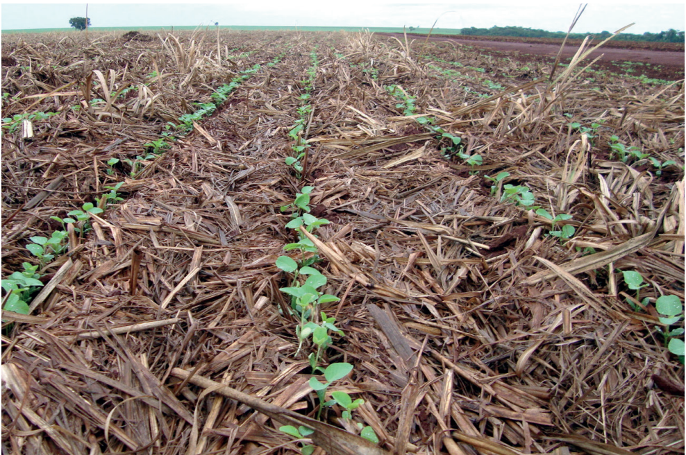
Figure 4. No-tillage farming of soybeans in sugarcane straw, Observation Unit of Usina Guaíra, SP. Embrapa projects: Rotcana e Cana.