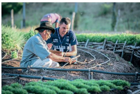
Figure 2. Family farming area: interplanting of beans, rice, sunflower, and corn in Pirenópolis, GO.