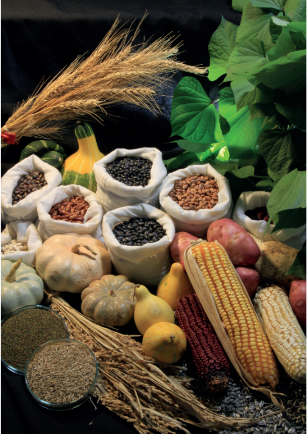
Figure 1. Family farming products, including seeds and traditional cultivars.