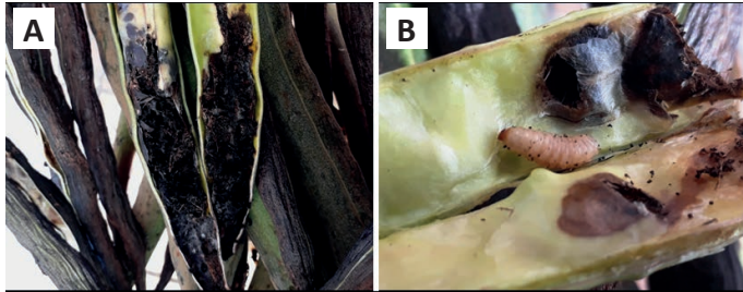
Figure 2. Attack of Cleogonus insulcatus Fiedler, 1954 on green pods of purple trumpet tree. A - Damaged pods with seeds preyed on by larvae. B - Detail of the larva on the seeds.

The damage caused by this insect was recorded mainly in the lower pods (86% of the attacked fruits), indicated that the attack occurs mainly from the bottom up (Fig. 2A). As the damage increased, a large amount of excrement was produced and the seeds were completely consumed, with damaged and blackened pods. In intense attacks, all seeds were preyed on and useless for planting. The larvae is whitish, with typical morphological features of Curculionidae family (Fig. 2B).