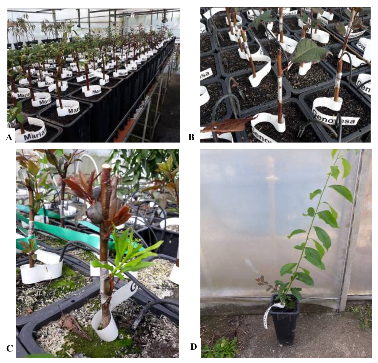
Figure 3. Process of budding of 'Irati' Japanese plum on the original cutting of newly rooted Prunus spp. A) Rooted rootstocks recently transplanted to citrus pots in an acclimatization environment with aerial irrigation; B) 'Irati' plum budded directly onto newly rooted cuttings of 'Genovesa'; C) Beginning of scion growth at 146 days after budding; D) Scion growth (cultivar 'Irati') on 'Genovesa' rootstock in citrus pots at 199 days after budding.

Therefore, in our study, we could clearly see the effect of the genotype on the capacity for rhizogenesis and stomatal control in the acclimatization stage, conditions that directly influence the success and quality of the rooted material, and several studies have already highlighted the greater capacity for rhizogenesis of plum cuttings, in relation to the peach tree, as well as their survival rate (KERSTEN et al. 1994, DUTRA & KERSTEN 1996, SCHWENGBER et al. 2002, TONIETTO et al. 2005).