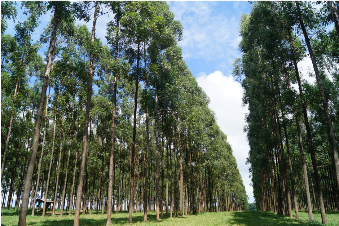
Figure 2 Integrated livestock-forest system in March 2019, with trees' spacing of 15 m x 4 m (167 stems ha -1 ).

hectare. One RSU is defined as an animal with an intake of 6000 MJ ME year -1 or 550 kg DM year -1 . As an example, ewes are roughly 1 RSU each, while steers 5.5 RSU each. The stocking rate in CONT represents a typical condition for Brazilian grasslands, as the national average rate is 5.06 RSU ha -1 (Brazilian Institute of Geography and Statistics 2019). The rotational grazing system (ROT) was established in 2007, based on a monoculture of palisade grass ( Urochloa brizantha 'Piatã'). The system is divided into six paddocks, and the grazing management was kept as six days of grazing and 30 days of rest throughout the year. The stocking rate ranged from 8.3 to 16.5 RSU ha -1 , or 1.5 to 3.0 AU ha -1 , depending on forage availability in each season.