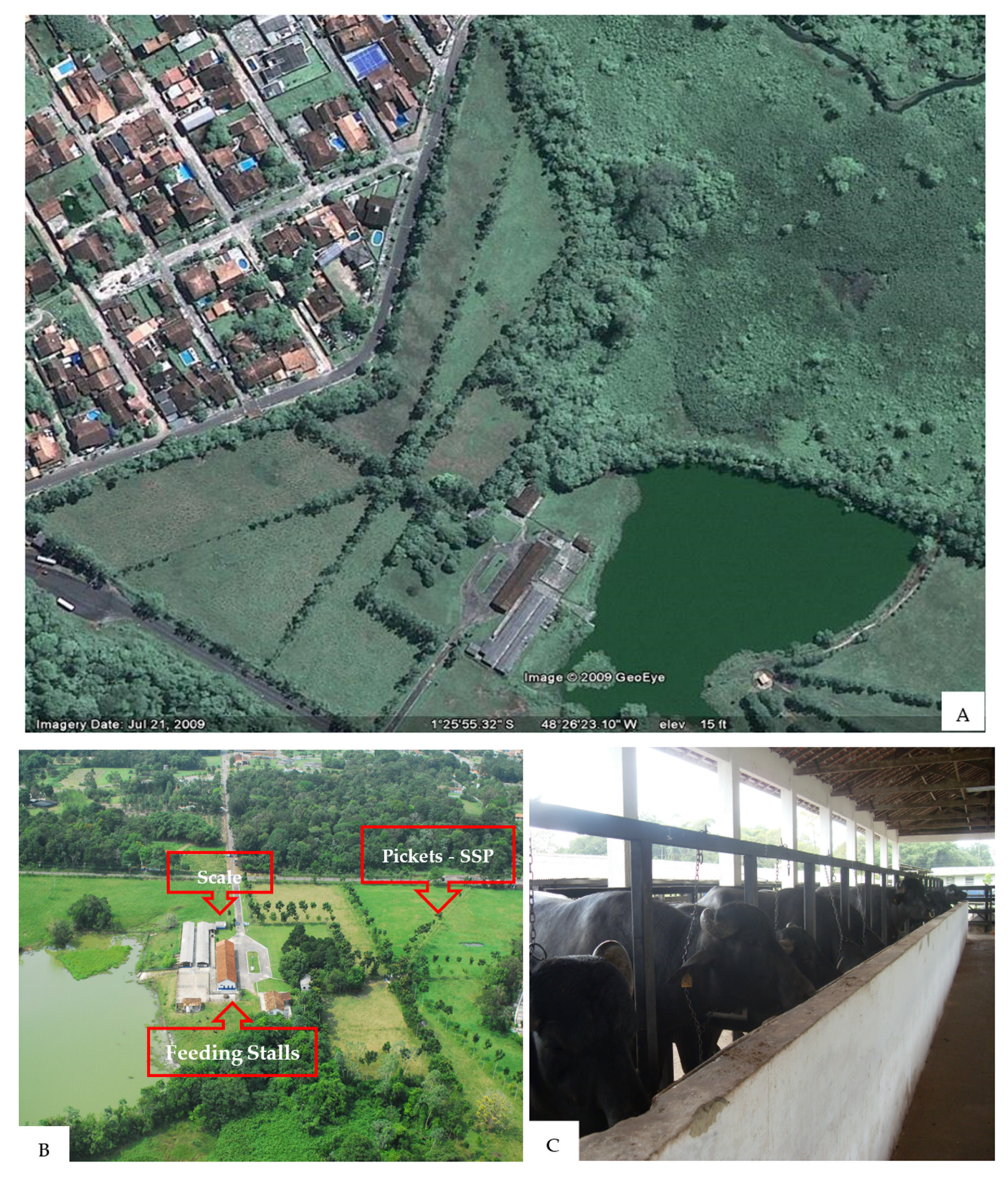
Figure 1. Experimental area. ( A ) Experiment area. ( B ) Description of the main areas of the experiment. ( C ) Animals separated into individual feeding pens. SSP = silvopastoral system.

In addition to grazing, the animals had access to water and mineral salt ad libitum, as well as to supplementation prepared with agro-industrial co-products, the chemical compositions of which are shown in Table 1.