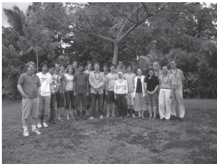
Participants at the ENSO Summer School

The summer school was generously supported by WCRP, PAGES, NOAA, ARCNESS, the Australian Bureau of Meteorology, the International Pacific Research Center and Mathworks.