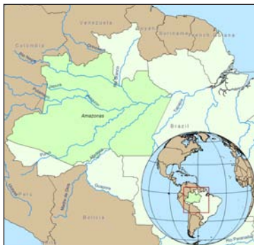
Overview of the Amazonas area in Brazil.

Despite this diversity, soils are predominantly dystrophic, with exchangeable calcium (Ca) and magnesium (Mg) lower than 1.5 cmol/dm 3 (Moreira and Malavolta, 2002).