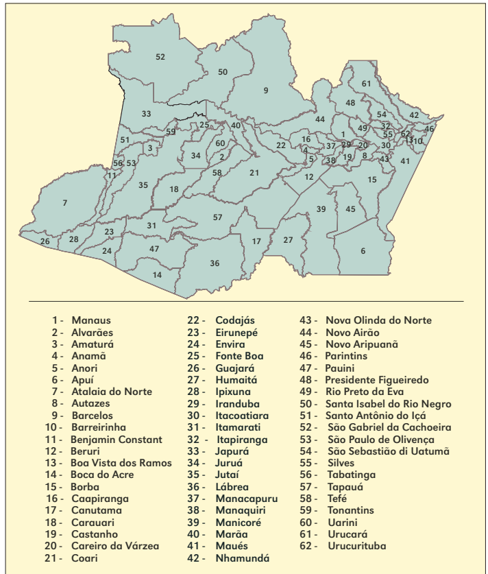
Figure 1. Counties in Amazonas State of Brazil.

Counties located inside a wide arch extending north to south had more than 80% of samples testing low in available P. The low values observed in