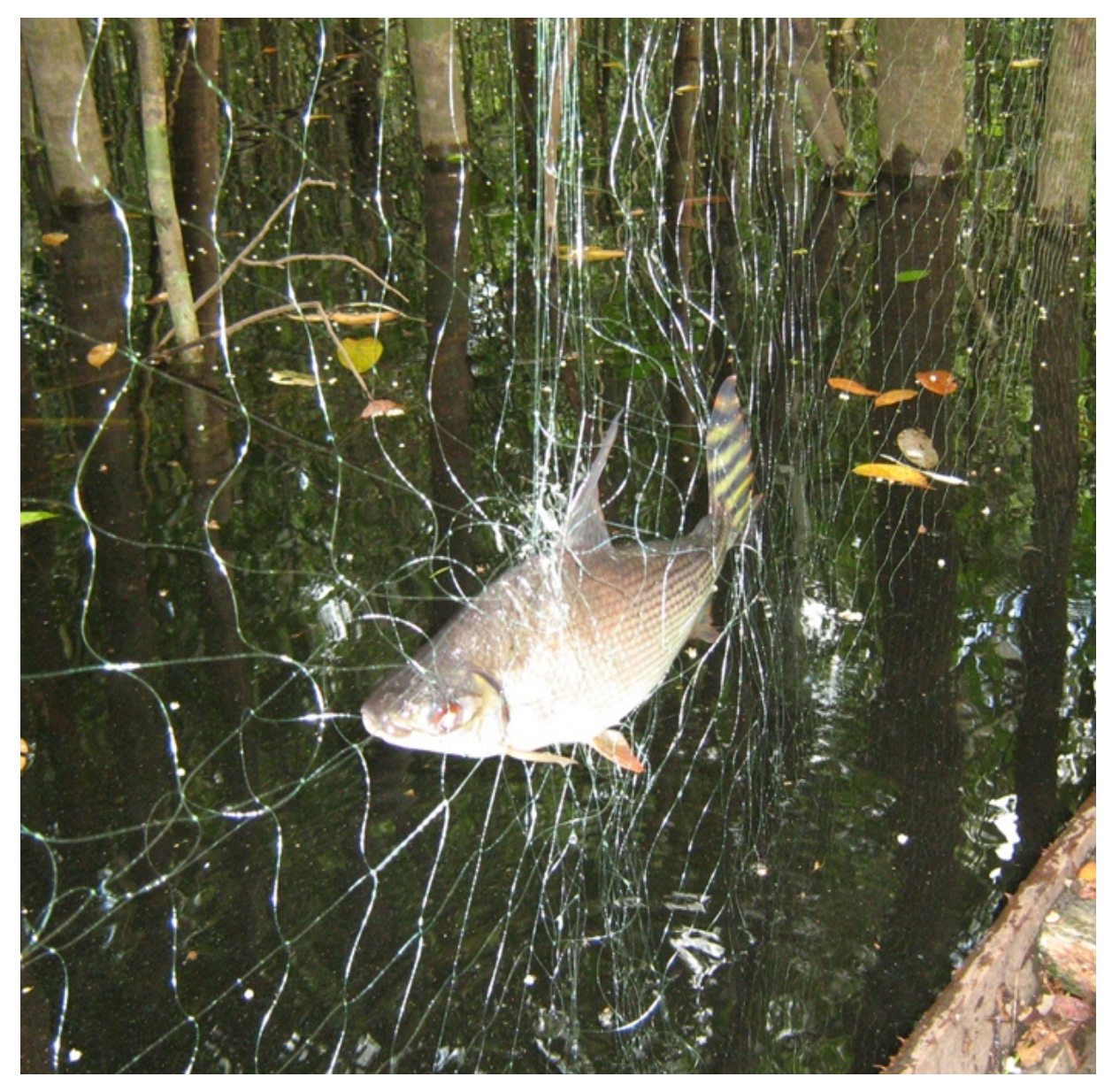
Figure 1 . Collection of tick-scaled jaraqui Semaprochilodus insignis to flooded area from the Coari Lake, middle Solimões River, State of Amazonas, Brazil.