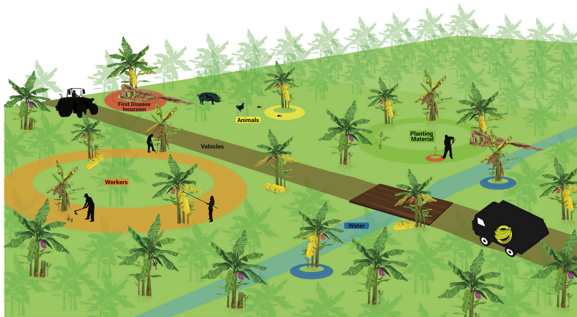
FIGURE 3 | Factors associated to pathogen spreading in Fusarium wilt epidemics in bananas. First incursion (upper left). Vehicles (middle). Planting material (upper right). Animals (upper left). Workers (bottom left). Water (in blue). These factors may operate separately or in association to disperse Fusarium oxysporum f. sp. cubense structures short or long distances.