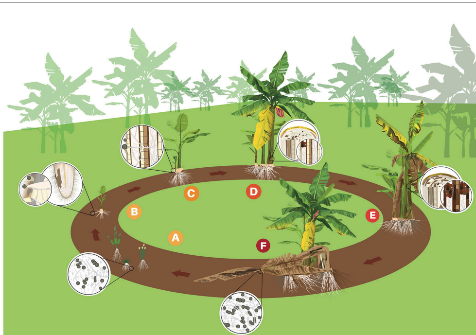
FIGURE 2 | Life cycle of Fusarium oxysporum f. sp. cubense ( Foc ) in banana. (A) Spores (micro and macro conidia and chlamydospores) rest in the soil or on alternative hosts such as weeds. (B) Chlamydospores germinate stimulated by root exudates and the germ-tubes penetrate banana roots. (C) Foc grows through the cortex to the epidermis and mycelium invades the vascular system. (D) Conidia and chlamydospores are constantly produced in the vascular tissues. Conidia are rapidly distributed through the plant via transpiration system. Mycelium and gum blocks the vascular tissues and first symptoms of yellowing are observed in the older leaves. (E) Foc colonizes and destroys more vascular tissues provoking intense wilting. (F) Infected plant dies and the follower plant (daughter), which was contaminated by the mother plant through vascular connection, shows initial symptoms. Mother plant eventually falls down and disease cycle starts again.

identified seven SIX genes ( SIX1 , SIX2 , SIX6 , SIX8 , SIX9 , SIX10 , and SIX13 ). Strains belonging to R1 and R2 generally share the same profile of SIX . In contrast, strains of SR4 and TR4 presented more diverse profiles (Czislowski et al., 2017). The homologues, SIX1 and SIX9 were conserved in all VCGs, while no SIX genes were observed in a non-pathogenic F. oxysporum strain analyzed (Czislowski et al., 2017).