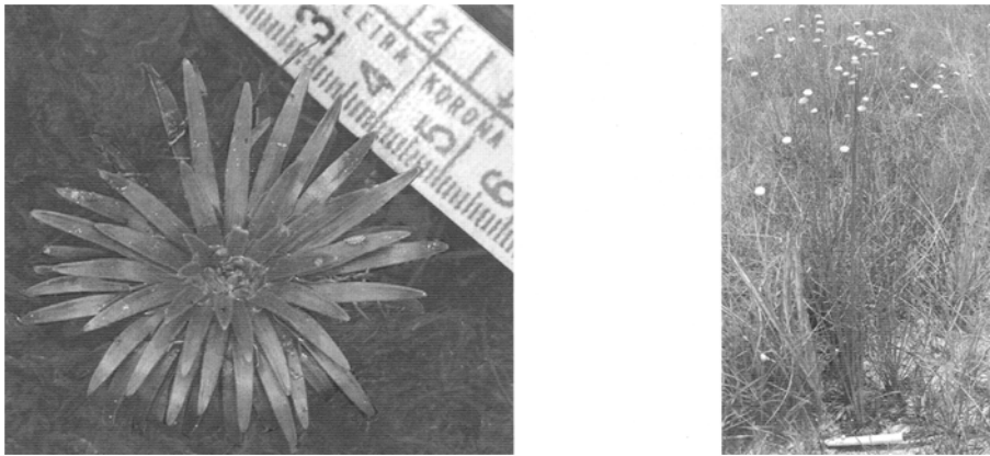
Fig. 2. A rosette (A) and three Syngonanthus nitens plants with scapes (B).

can reach up to 20 m height. In Jalapão, most of the gallery forests are swamp forests, (called veredas ) dominated by buriti palm ( Mauritia flexuosa L.f.). These swamp forests are delimited by humid grasslands ( campos úmidos ) on organosoils dominated by grass species around 0.50 m in height and characterized by the occurrence of Xyridaceae, Cyperaceae, and Eriocaulaceae, including Syngonanthus nitens . These humid grasslands occur as a belt between the scrubland ( cerrado or campo sujo ) and the gallery forest (Ratter et al. 1997). In Jalapão, they are usually between 50 and 100 m wide.