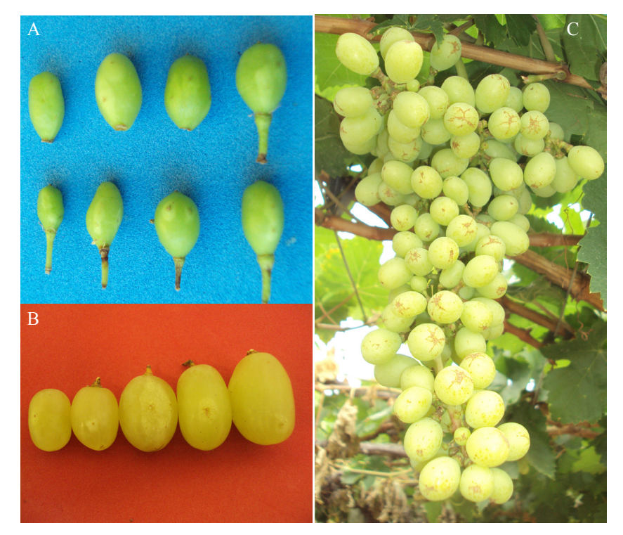
Figure 2 – Injuries in Thompson Seedless grape berries, Casa Nova, BA. A-Injuries caused by F. schultzei , F. brevicaulis , F. gemina , F. gardeniae and Frankliniella sp at the young berries phase. B-Injuries caused by F. schultzei , F. brevicaulis , F. gemina , F. gardeniae and Frankliniella sp. at harvest. C- Starfish-shaped scars.

Starfish-shaped injuries were also observed (Figure 2C), corroborating previous studies about Thompson Seedless grapes (Jensen, 1973; Jensen; Flaherthy; Luvise, 1981; Ripa; Rodriguez; Vargas, 1993). In the present work, these scars were more evidenced on the clusters from the treatment by the grower, i.e., those that were not bagged. Probably, this injury results from the persistence of the