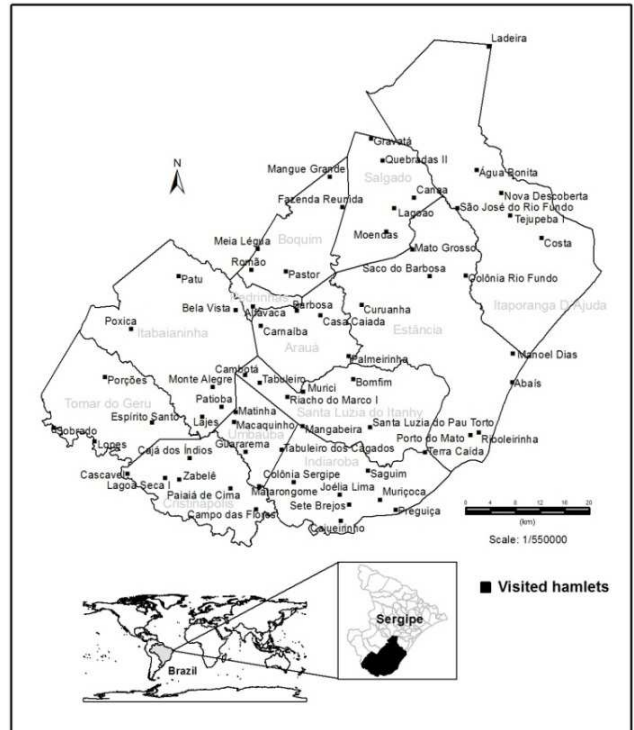
Figure 3. The Southern Rural Territory of Sergipe.

The Fig. 3 shows the Southern Rural Territory of Sergipe (SRTS) which includes twelve municipalities (Itaporanga d'Ajuda, Salgado, Estância, Boquim, Arauá, Pedrinhas, Santa Luzia do Itanhy, Indiaroba, Umbaúba, Cristinápolis, Tomar do Geru and Itabianinha) from the state of Sergipe, Brazil [1]. It comprises 3,950.90 km<sup>2</sup> with a total population of 278 955 inhabitants, of which 44% reside in rural areas. It has 1,256 settled families and 20,599 establishments attached to the familiar agriculture. The agriculture and livestock are the main rural economic activities in this region with a significant participation of family farmers. It has observed a strong presence of permanent crops such as orange and coconut.