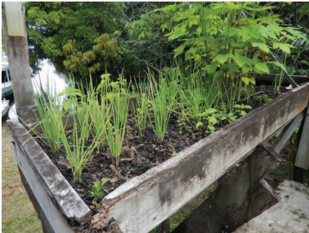
Figure 1. Traditional use of charcoal pieces (biochar) to enhance soil to cultivated horticultural crops in the Amazon