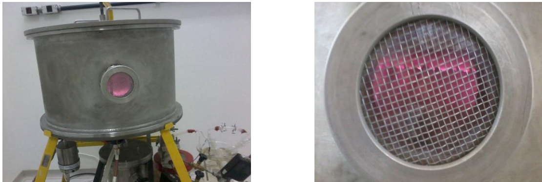
Figure 1. Plasma reactor (left) and luminescent discharge inside the cold plasma reactor (right).

by a gas flow system and dispersion of gases inside the chamber is performed using a homogenous spatter around the reactor.