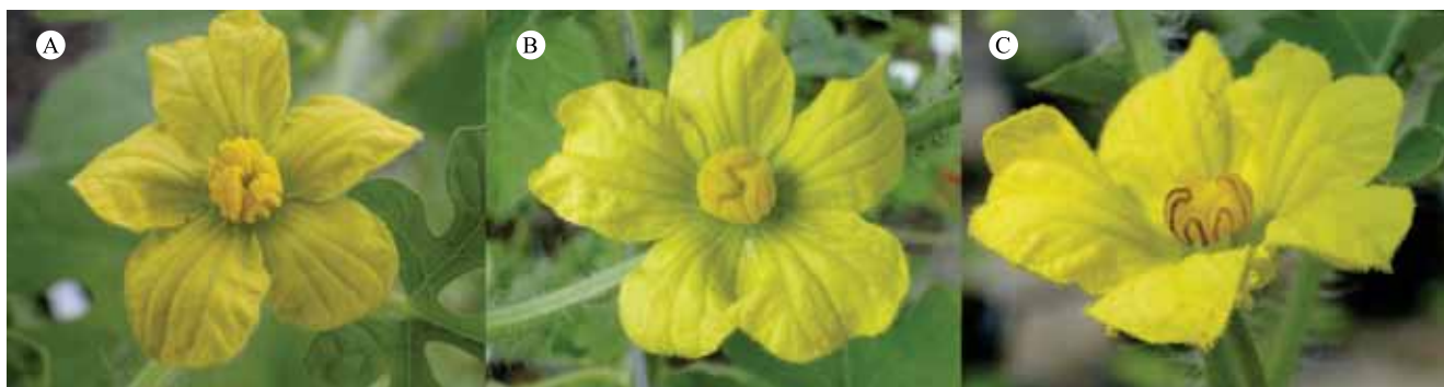
Figure 1. Pollen grains on anthers: A, staminate flower (2n) of the Minipol variety with typical amount of pollen; B, HA-5161 staminate flower (3n) with typical amount of pollen; C, HA-5161 staminate flower (3n) with anthers with a dehydrated appearance.

Regarding the flower opening and closing time, the five varieties showed the same period of anthesis. In general, flowers of both sexes began corolla expansion in the first few hours of sunshine, approximately at 5:20 a.m. (at 24.2°C, 97.1% humidity, and 0.430 klux), and remained open throughout the morning until they finally closed in the early afternoon, around 2:20 p.m. (at 33.2°C, 65.6% humidity, and 36.9 klux), with a total anthesis period of 9 hours. These results are similar to those reported by Stanghellini et al. (2002) and Azo'o Ela et al. (2010). Regarding the movement of petals, corolla expansion and retraction for both pistillate (Figure 2 A to K) and staminate flowers (Figure 3 A to K) behaved as follows: soon after opening, the