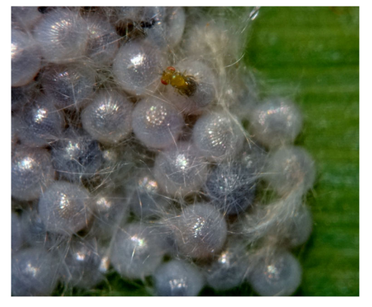
Fig. 1 Female of Trichogramma pretiosum parasitizing egg mass of Spodoptera frugiperda at maize leaf

Insects captured in pheromone traps have been used as a tool in IPM decision-making and to initiate chemical control