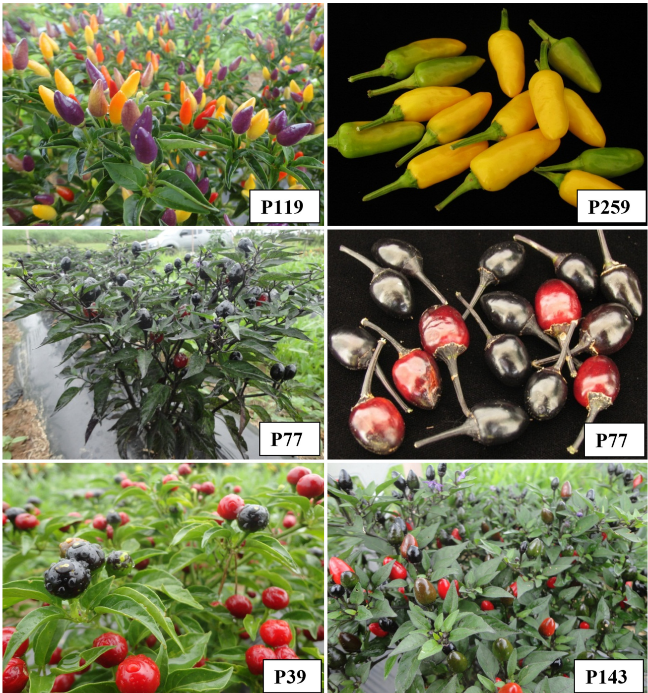
Figure 2. Accessions of Capsicum annuum peppers evaluated for synthesis of bioactive compounds. Accession P119, which showed the highest content of phenolic compounds, with fruits at different stages of maturation. Accession P259, which presented the lowest content of anthocyanins. Unripe (green) and ripe (yellow) fruits. Accession P77, which showed the highest content of anthocyanins. Plant in the field (left) and fruit at different stages of maturation (right). Accessions P39 and P143, which showed high levels of carotenoids.

Therefore, lower values obtained for the content of anthocyanin for accession P259 were expected, because yellow fruits are not within the color range reported by the authors. The levels of pigments in peppers fruits are influenced by genetic factors, degree of ripening fruits and climatic conditions (Ribeiro & Reifschneider, 2008). Besides contributing to flower and fruit colors, anthocyanin act as UV filter on the leaves. In some plant