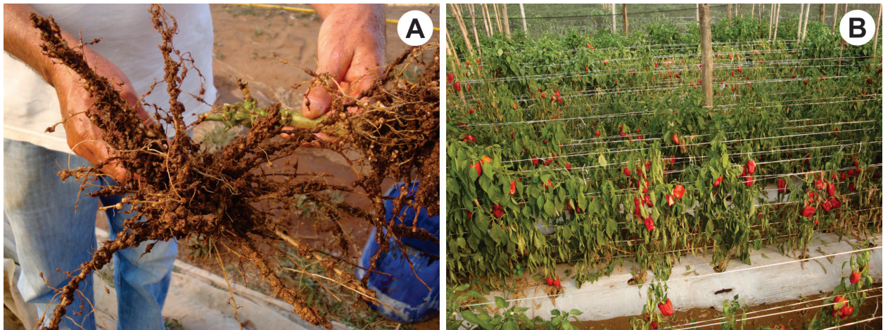
Fig. 1. Root systems of the F 1 hybrid Snooker infected by Meloidogyne enterolobii in production area of Taquara (Central Brazil), 2014. Affected plants displayed necrosis accompanied by a profuse production of galls (A). The above-ground symptoms were characterized by an overall yellowing, severe wilt and premature defoliation (B).