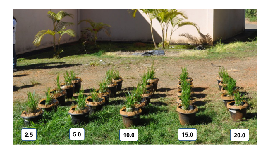
Fig. 1 Pots containing Rhipicephalus microplus larvae, each corresponding to a treatment with a different concentration to thymol (mg/mL)

Essential oils and their constituents are promising alternatives to the use of synthetic chemical compounds to control plant and animal pests, aiming to diminish the negative effects of synthetic pesticides (Bakkali et al. 2008). The acaricidal activity of thymol, a monoterpene found in essential oil of plants of the families Lamiaceae and Verbenaceae (Pengelly 2004), has already been demonstrated in vitro studies on larvae (Novelino et al. 2007; Scoralik et al. 2012) and engorged