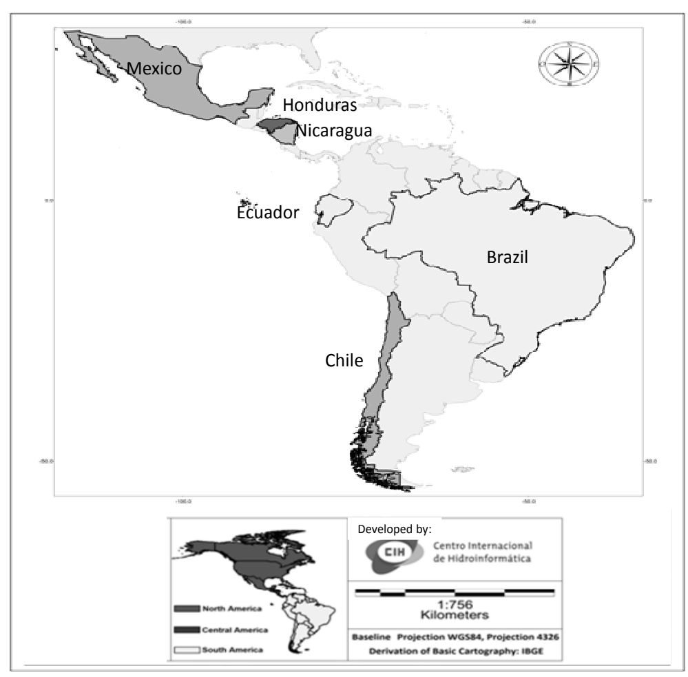
Fig. 2 Countries involved in the study.