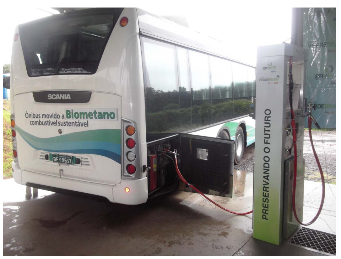
Fig. 3 Biomethane fueling station.

potential, however, is a raw material not a product. To get to the real and qualified biogas fuel potential, one must refine it in different intensities to obtain biomethane, which was considered a fuel product of potential to match the natural gas.