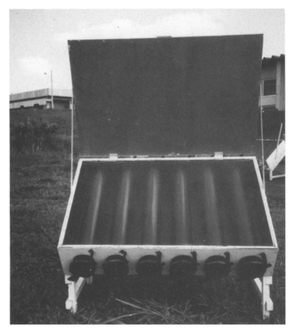
Fig. 1. Solar collector with tubes of 15 cm diameter and aluminium lid positioned to reflect the sun to the tubes filled with infested soil.

by a sheet of aluminium foil which is lifted to increase the solar radiation inside the box. Soil is placed in the tubes through the upper hatch and recovered through the lower.