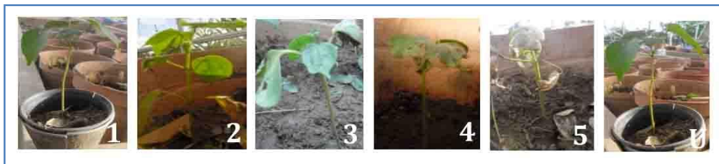
Figure 1 1-5 Fusarium wilt infection severity scaling on basis of foliar symptoms. U- Uninoculated

All diseased plants showed wilting symptoms and when dissected had brown colouration in their stems (Figure 2). On basis of foliar symptoms, the cultivars UK91, UK08, UKM08, Cedro and Araça were found more susceptible to F. oxysporum f. sp. vasinfectum as they presented relatively higher disease severity index (Figure 3). However, two of the Brazilian germplasm viz Ipê and Aroeira exhibited relatively low disease severity indices. These two cultivars also had higher plant survival percentages compared to the others. Low disease severity index was generally seen to be associated with relatively higher plant survival and vice versa. There was an extensive range of symptoms observed on other parts of the plants in addition to foliar symptoms. These included vascular browning (Figure 2), chlorosis and abscission of cotyledons, chlorosis and necrosis of individual or multiple leaves, plant wilting, stunted growth and death of plants.