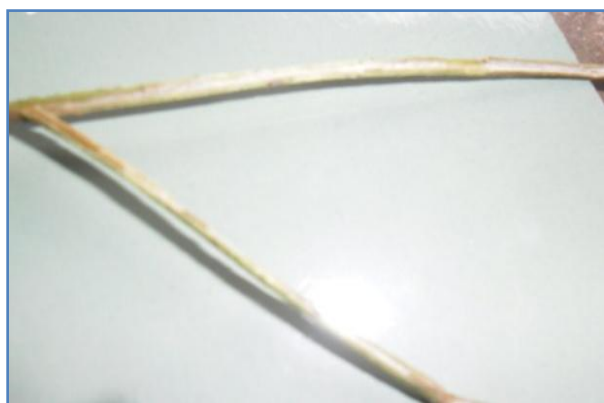
Figure 2 Vascular discoloration symptoms for infected plants

One way-ANOVA revealed a significant difference ( p < 0.0001 ) among the cultivars for foliar/wilting symptoms. Highest mean disease severity index was recorded from the cultivar UK91 (85.91) and Ipê recorded the lowest index (37.69) (Figure 3). Similarly, the percentage of plant survival varied significantly ( p = 0.0001 ) across the cultivars with Ipê recording the highest plant survival percentage and UK91 the least (Figure 3).