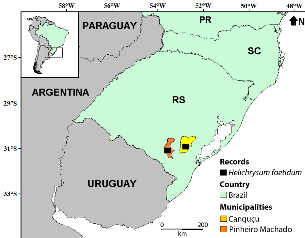
Figure 1. First records of Helichrysum foetidum , in South America at the municipalities of Canguçu ( G. Heiden 1143; 1735) and Pinheiro Machado ( G. Heiden 1775), Rio Grande do Sul, Brazil.

al. 2008). The genus comprises approximately 600 species and Africa is the region of occurrence with highest diversity, where Helichrysum foetidum (L.) Moench is native from (Beentje et al. 2005).