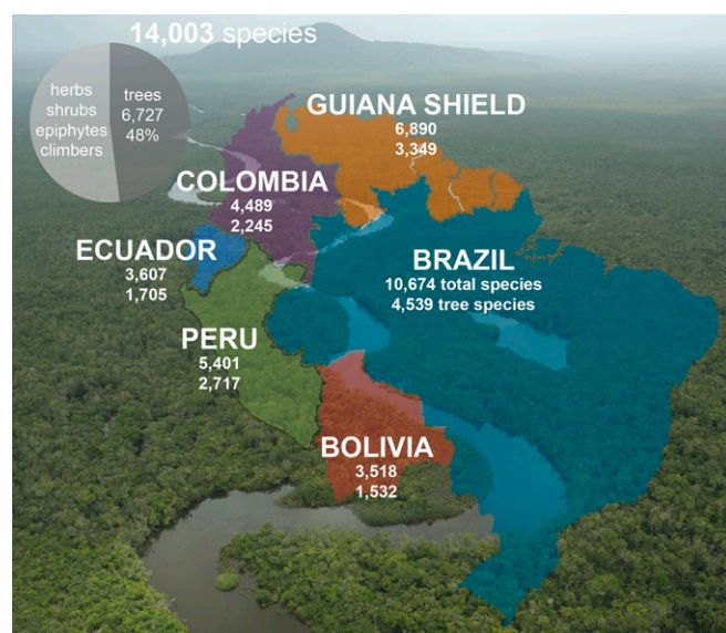
Fig. 1. Species richness of seed plants in the lowland Amazon rain forests ( \leq 1,000 m). Numbers of species are shown by country (and the Guiana Shield area) for all seed plants and for trees. The background shows the Amazon forest in Serra da Mocidade National Park, Brazil.

Source of Diverging Species Number Estimates in the Amazon. Recent counts of global seed plant species diversity, calculated mainly from the World Checklist of Selected Plant Families (40), vary from 370,492 (41) to 296,462 (42). Thus, our estimate of 14,003 species from the lowland Amazon rain forests suggests that these forests shelter between 3.8% and 4.7% of all seed plant species. Taking into account the area of Amazonia ( \sim 5,500,000 km 2 , corresponding to \sim 3.6\% of the global land surface), our estimate roughly matches the overall global species/area average for seed plants. Our taxonomically verified list suggests that the tree species diversity in the Amazon rain