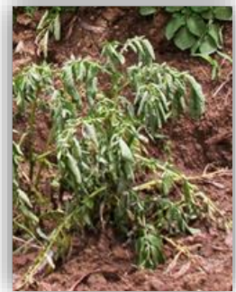
Fig. 14. Grade 3 > 50% wilted

Average wilt severity scores for each clone/control can then be computed over replications.