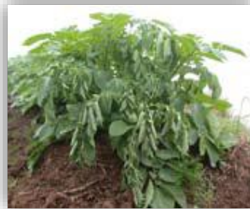
Fig. 13. Grade 2 ≤ 50% wilted