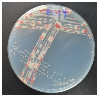
Figure 7. Colonies of R. solanacearum in MKM with TZC

Pathogen description: R. solanacearum is gram-negative, rod-shaped bacterium that grows well at 28 to 32°C strictly in aerobic conditions (Hayward, 1991; Schaad et al. , 2001). Individual colonies of normal or virulent isolates are usually visible after 36 to 48 hours. These colonies are characterized by irregular shape, fluidal and entirely white or with a pink center on modified Kelman's medium (MKM) with 2,3,5 triphenyl tetrazolium chloride (TZC) (Fig.7) (French et al. , 1995).