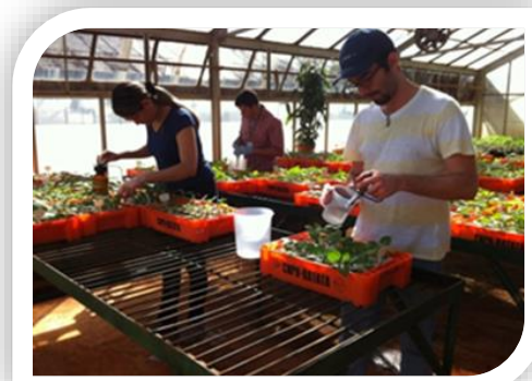
Figure 11. Inoculation of seedling with a suspension of the bacteria.

Heating devices may be required during the nights to ensure infection and reduce the frequency of escapes. Wilting seedlings appeared from seven to 10 days after inoculation and plants will be evaluated in a 1 and 0 score every 5 days, as follows: