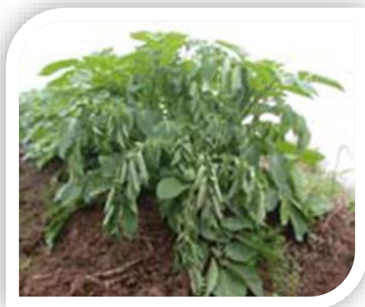
Figure 1. Potato plant showing wilted leaves

Transmission and spread: R. solanacearum survives in infected plants, plant debris, soil, water, seeds, vegetative propagation material and in the rooting system and rhizosphere of many other host crops and weed. Infected potato seed is the main cause of pathogen's dissemination to long distances. After infestation, R. solanacearum can survive in the soil for many years, period that depends on the pathogen strain and the crop rotation program. The pathogen spreads through irrigation with contaminated water, utilization of infected vegetative planting material, and infested soil adhered to tools, hooves and farmers' shoes.