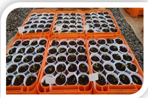
Figure 10. Seedlings representing replication of a family of 120 seedlings transplanted into 250 ml. plastic cups.

development ( 28\pm 4^{\circ}\text{C} and 85-90% R.H.) and inoculated by pouring 10 ml of a suspension into the base of the plant (approximately 10^7 to 10^8 cfu / ml) (Fig. 11).