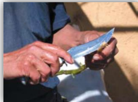
Figure. 3. Stem being cut

As the disease develops, massive invasion of the cortex might result in the appearance of water-soaked lesions on the external surface of infected stems and streaky brown discolorations of the stem may be observed on stems above the soil line (Fig. 2) and the leaves may have a bronze tint (Gota, 1992). If an infected stem is cut crosswise (Fig. 3), tiny drops of dirty white or yellowish viscous ooze exude from several vascular bundles (Fig. 4) (Champoiseau et al., 2009b). This test denoted as “the vascular flow test” allows us to confirm the presence of the R. solanacearum in wilted plants. Under hot and humid conditions, complete wilting occurs, the plant becomes yellow and brown necrotic and eventually the plant dies. Wilting by R. solanacearum can be confused with wilting caused by other pathogens such as Pectobacterium , Dickeya , Fusarium or Verticillium spp, as well