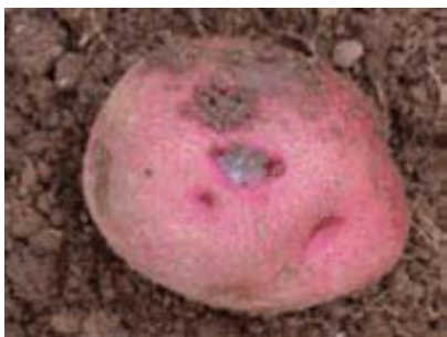
Figure.5. Oozing due to bacterial wilt

On tubers, external symptoms may or may not be visible, depending on the state of development of the disease. Tubers exhibit browning of the vascular ring and/or a bacterial ooze that often emerges from the eyes and stolon-end attachment of infected tubers (Fig. 5.). This ooze is a creamy fluid exudate clearly seen in tubers cut transversely (Fig. 6.). Soil may adhere to the tubers at the eyes as a result of the soil particles sticking on the bacterial ooze. Plants with foliar symptoms caused by R. solanacearum may bear healthy and diseased tubers, while plants that show no signs of the disease may sometimes produce diseased tubers. Soil may also be seen to adhere to the eyes of such tubers as a result of the soil particles sticking on the bacterial ooze.