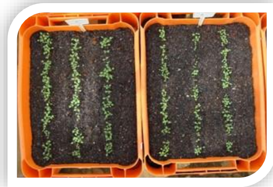
Figure 9. Emerging seedlings from true seed sown in plastic crates

A complete fertilizer (N-P-K 20-20-20, diluted at 0.5% in water) can be applied at the time of planting if no commercial substrate was used. Twenty days later, seedlings are transplanted into 250 mL plastic cups containing the same substrate mixed (soil, sand and peat moss in 2:1:1 proportions, or Promix). In case Plantmax® is used, add sterilized soil in equal proportions (Fig.10). When stem cuttings of segregating progenies are used, these can be planted directly into 250 mL plastic cups containing the soil, sand and peat moss in 4:3:1 proportions. The seedlings and stem cuttings are kept in a greenhouse protected with anti-aphid screen, well ventilated and with good luminosity to avoid dampness. Plants are irrigated daily, except a day before inoculation. Ten days after transplanting in the case of seedlings or once stem cutting have rooted (20 days after planting), these are transferred (if required) to a greenhouse with conditions that favor disease