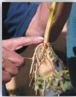
Figure 2. Streak discoloration of the stem

The initial symptom in mature plants is wilting of upper leaves usually first visible at the warmest time of day followed by recovery throughout the evening and early hours of the morning. The wilted leaves maintain their green color as the disease progresses (Fig 1.). Epinasty of the petioles may occur.