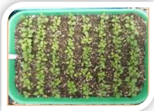
Figure 8. Seedlings from true seed three weeks after planting

True seed representing a progeny of individuals are sown after GA treatment (1500 ppm) directly in a small tray (Fig. 8) or plastic crates (Fig. 9) containing a soil substrate composed of soil, sand and peat moss in 2:1:1 proportions. Make rows or wholes of 0.4 inch deep spaced 2 inches apart. Best results are obtained using the Promix BX® substrate (Premiers Brands, INC, Stamford, Canada) or the commercial substrate Plantmax® produced with composite pinus peel, vermiculite and basic fertilization.