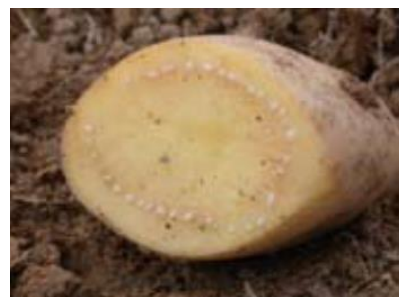
Figure.6. Creamy fluid exudate seen in tubers cut transversely