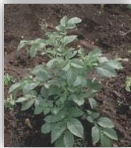
Figure 12. Grade 1 Healthy plant