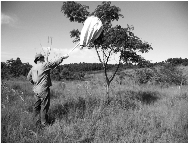
Fig. 1. Psyllids sampling with a beating net in the middle in a seven-year-old plantation of Enterolobium contortisiliquum in an abandoned open-pit coal mine in Candiota, RS, between May 2014 and April 2016.

and is utilised for a variety of purposes. It is planted as shade tree in streets and gardens as well as in agroforestry systems, e.g., for cocoa and yerba mate. Its rapid growth and nitrogen-fixing abilities make it useful for revegetation, soil stabilisation and improvement, as well as land reclamation. It is tolerant of copper-contaminated soil. The tree is also harvested for its timber and medicinal uses, and the foliage is eaten by cattle (Praciak et al., 2013).