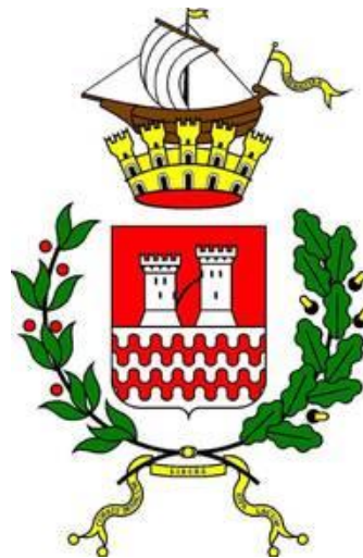
Riva del Garda municipality