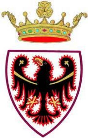
Autonomous Province of Trento