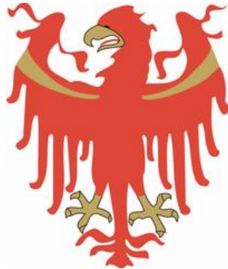
Autonomous Province of Bolzano