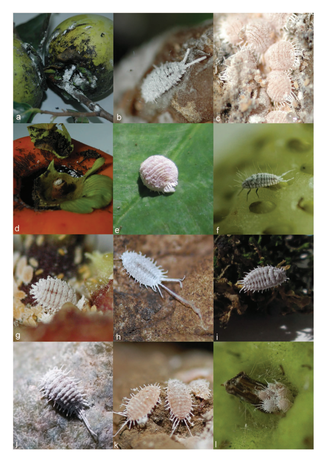
Figure 1. Mealybug species found in fruits on Serra Gaúcha region. ( a , b ) 9 Anisococcus granarae (2.08–3.28 mm<sup>55</sup>); ( c , d ) 9 Dysmicoccus brevipes (1.3–2.7 mm); ( e ) 9 Dysmicoccus sylvarum (up to 4.4 mm<sup>25</sup>); ( f ) 9 Ferrisia meridionalis (3.2–3.5 mm); ( g ) 9 Planococcus ficus (1.4–3.2 mm<sup>40</sup>); ( h ) 9 Pseudococcus longispinus (1.0–4.0 mm); ( i , j ) 9 Pseudococcus sociabilis (1.9–3.2 mm<sup>43</sup>); ( k , l ) 9 Pseudococcus viburni (1.8–3.5 mm<sup>43</sup>).

the 28S and COI genes<sup>18,23</sup>. In the Serra Gaúcha region, Ps. viburni was observed at a low infestation level in apple orchards. Nymphs and adults were found often in the calyx and sometimes also near the pedicel of the fruit. When these mealybugs were present, damage was caused by honeydew excretion resulting in the development of sooty molds. In other countries, including Argentina, Italy, New Zealand and South Africa, Ps. viburni is considered the most economically important species found infesting apple and pears<sup>30–33</sup>. This species was also the dominant species in strawberry fields (>than 99% of the specimens collected). To date, there have been only three