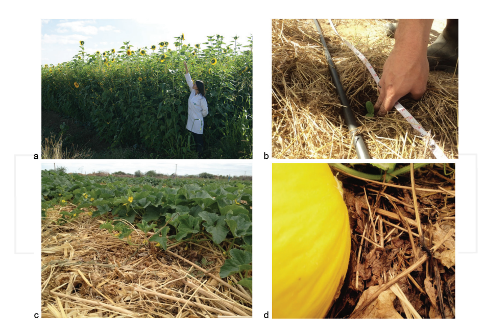
Figure 5. Plant mixture preceding melon crop (a), t melon seedlings in plant mixture residues (b), no-tillage system of melon crop (c), and detail of the harvest phase with residues still on the soil (d).

gray-seeded mucuna ( Stizolobium cinereum Piper and Tracy), crotalaria ( Crotalaria juncea ), rattlebox ( Crotalaria spectabilis ), jack beans ensiformis), lab-lab bean ( Dolichos lablab L.); grasses: sesame ( Sesamum indicum L.), corn ( Zea mays ), pearl millet ( Pennisetum americanum L.), and milo ( Sorghum vulgare Pers.); oil seed: pigeon pea ( Cajanus cajan L.), sunflower ( Helianthus annuus ), castor oil plant ( Ricinus communis L.) ( Figure 5a ). The spontaneous vegetation was composed by the predominant species: Benghal dayflower ( Commelina benghalensis L.), purple bush-bean ( Macroptilium atropurpureum ), Florida beggarweed ( Desmodium tortuosum ), and goat's head ( Acanthospermum hispidum DC).