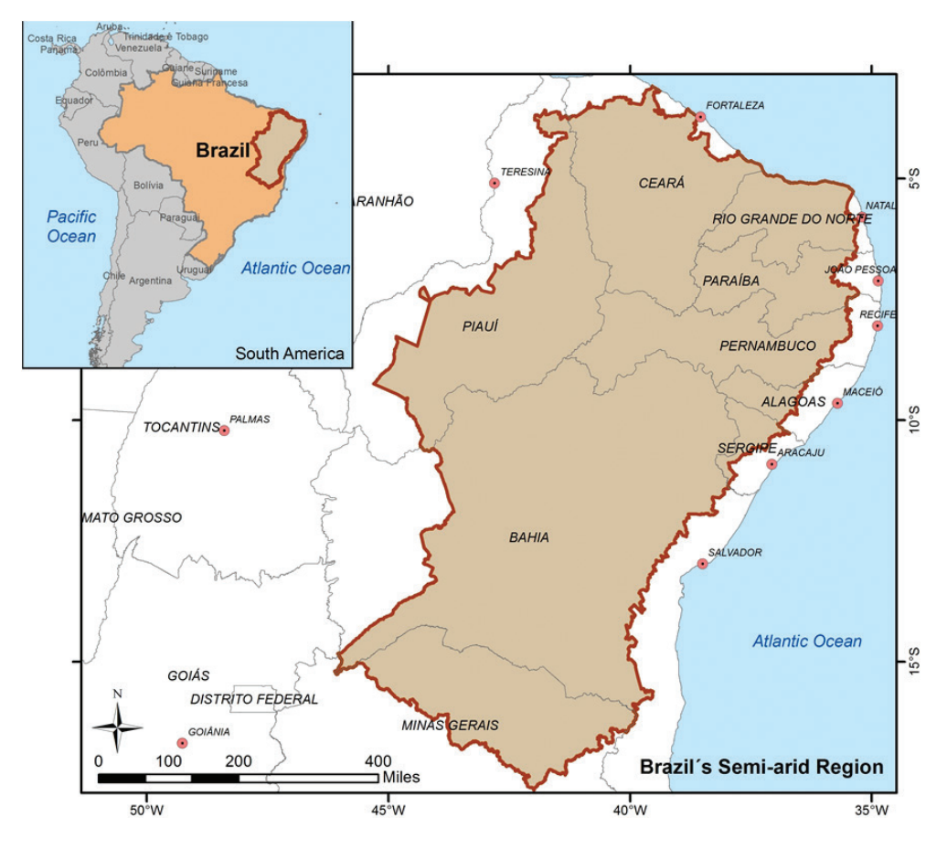
Figure 1. Map of Brazilian semiarid region.

temperatures can intensify hydric deficiency, affecting the availability of water for human consumption and for the rain-dependent agricultural activities. The increase of drought in the Northeast and changes in the characteristics and distribution of vegetation warn the risk of aridization of the region [20]. With these characteristics, the semiarid region is the most vulnerable Brazilian region to climate changes due to the increased difficulty of accessing water, food, and energy and due to the economic and social crisis [21].