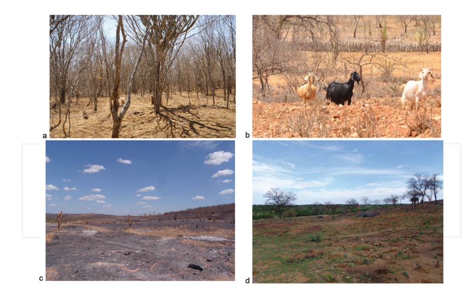
Figure 3. Images of the Caatinga in the dry period (a), current model of goat breeding, exploring native vegetation and degraded pastures (b), area in which vegetation was removed and burnt (c), and area cultivated with forage palm (d).

Low Carbon Technologies for Agriculture in Dryland: Brazilian Experience 111 http://dx.doi.org/10.5772/intechopen.72363