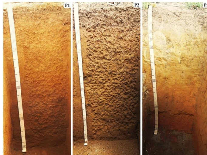
Figure 2. Image of the three profiles described in the south coast of Pernambuco.

The soil position within the slope had no strong influence on its morphological attributes. Such uniformity can be attributed to a wide susceptibility of basalt saprolite to constantly hot and humid climates, as in the region, resulting in a uniform development regardless of the land position.