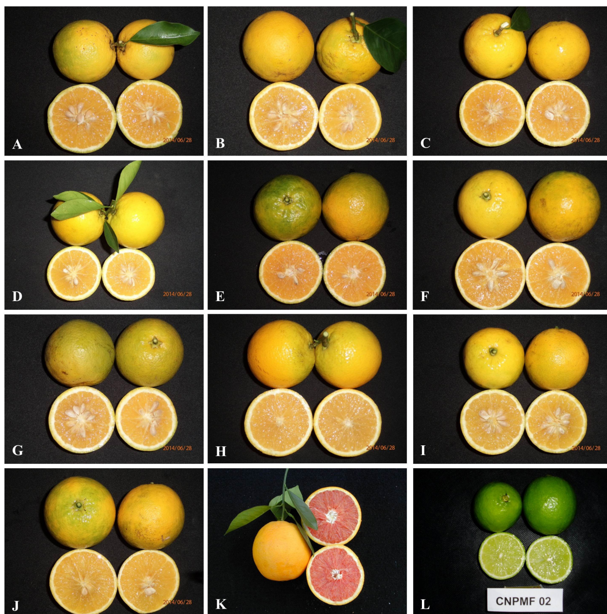
Figure 2. Typical mature fruits of ‘Aquiri’ (A), ‘Biondo’ (B), ‘Jaffa’ (C), ‘Kona’ (D), ‘Melrosa’ (E), ‘Pineapple’ (F), ‘Russas CNPMF-03’ (G), ‘Salustiana’ (H), ‘Seleta Amarela’ (I), ‘Westin CNPMF’ (J) and ‘Cara Cara’ (K) sweet oranges [ Citrus sinensis (L.) Osbeck] and ‘CNPMPF-02 Persian’ lime [ C. latifolia (Yu. Tanaka) Tanaka] (L), evaluated at seven years of age on different rootstocks on the northern coast of the state of Bahia, Brazil, 2014.