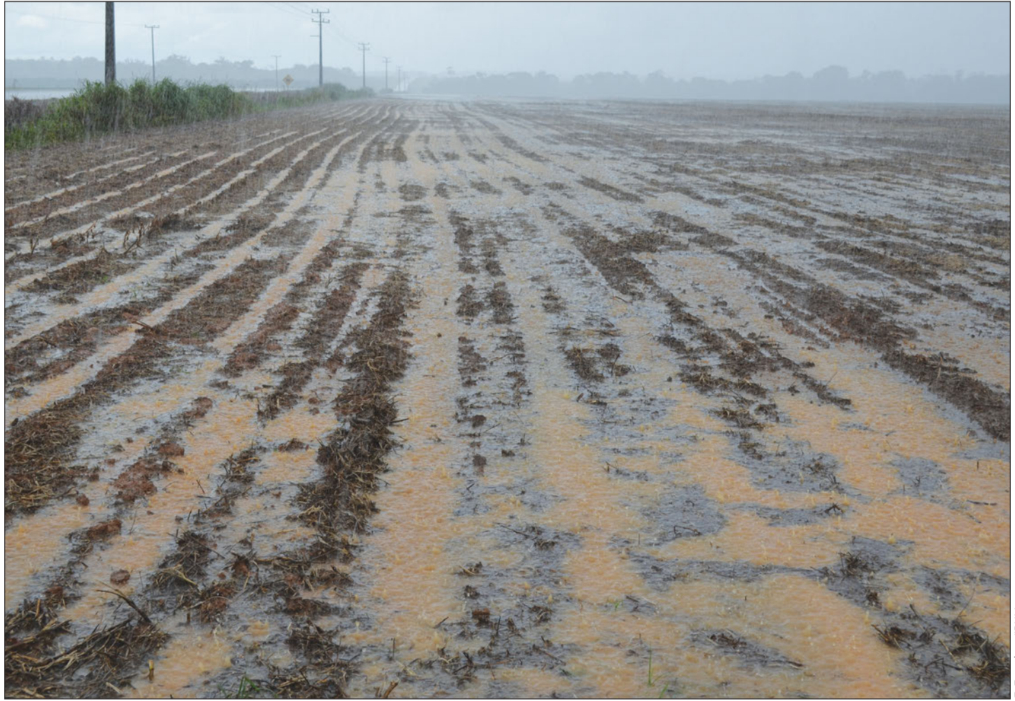
Runoff happens - even in the well-drained Oxisols of the tropics.

If P fertilizers are broadcast, soluble and particulate P will accumulate at the soil surface leaving a larger portion susceptible to reaching water reservoirs through runoff—even in the Oxisols of the tropics. When applying P fertilizer in-furrow, the chance of P movement with runoff decreases significantly because it is incorporated deeper into the soil. Local research is always necessary to establish the potential risks of the different methods of P placement to runoff.