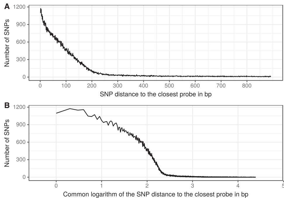
Figure 2. Distribution of off-target SNPs distances to the closest probe sequence coordinate. (A) The narrow spectrum of distances indicates that most of the identified SNPs are located up to 200 bp upstream or downstream to a targeted location in the genome. (B) The wide spectrum of distances shows that off-target variants were found spread across the genome in regions up to 25 kbp from the closest targeted probe location.