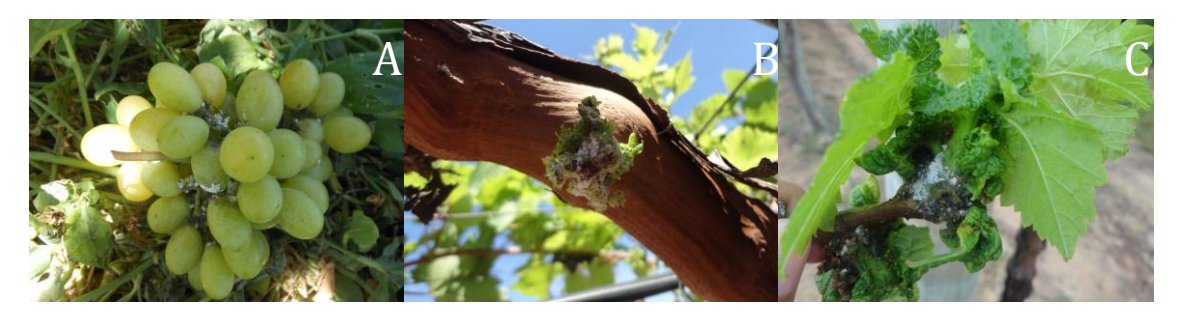
Figure 2. Maconellicoccus hirsustus in bunches (A), trunk (B) and sprout (C) of grapevine plants ( Vitis vinifera ).

*Grapevine areas presented in the map of Figure 1