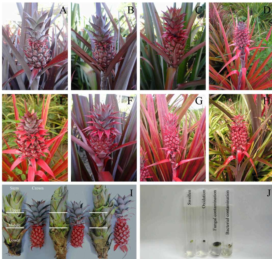
Figure 1. A-H) Pineapple hybrids for fiber production. (A) FIB-NEG and (B) FIB-BOY ( Ananas comosus var. microstachys x A. comosus var. erectifolius ); (C) FIB-POT, (D) FIB-MIN, (E) FIB-EST, (F) FIB-ROX and (G) FIB-CER ( A. comosus var. erectifolius x Ananas comosus var. bracteatus ); (H) FIB-SAI ( A. comosus var. bracteatus x A. comosus var. erectifolius ). (I) Explants for in vitro establishments from the crown and three different regions of the stem. (J) Swollen buds, with oxidation symptoms and bacterial and fungal contaminations from FIB-POT hybrid in stage of in vitro establishment. This figure is in color in the electronic version.

The swollen buds and plants formed were grouped by treatment and transferred to jars with multiplication medium containing MS salts and vitamins (Murashige and Skoog 1962) supplemented with BAP 0.5 mg L -1 , NAA 0.2 mg L -1 and Phytigel ® 2.5 g L -1 , a protocol adapted from Souza et al. (2013). The plants had their leaves cut off at the top to induce new shoots. The jars containing the plants were kept in the same incubation conditions as in the establishment phase. Four sub-cultures were performed at intervals of 45 days. Each sub-culture involved cleaning the roots, removal of the oldest leaves and sectioning of the stem to break the apical dominance and thus favor the formation of new adventitious shoots.