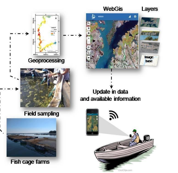
Figure 3. Water quality map can be visualized in WebGis interface

To support the integrated environmental management of aquaculture, the AgroTagAqua app, in development, will contain thematic forms, with questions related to fish farm productivity. This technology is increasing opportunities for crowdsourcing water quality data, and lays out a strategy for citizen engagement in decentralized water quality monitoring. The crowdsourcing, collected by local fish farmers, partners and technicians, allows for data collection over vast swaths of area and at various times for less cost. This information will feed the WebGis database and enable integrated analyzes with the other geoinformation in the database. The app also has a land use and coverage protocol for collecting information about the reservoir environment, focusing on the analysis of the influence of land uses on water quality indicators.