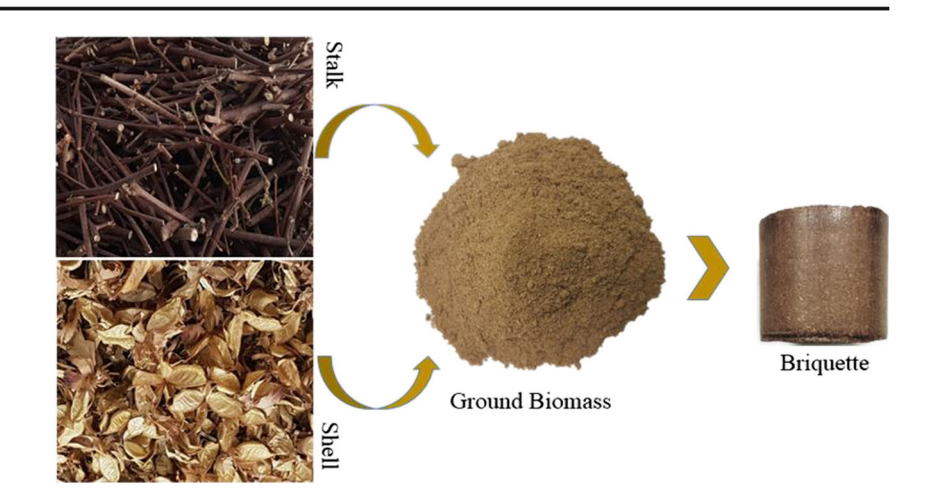
Fig. 1 Cotton stalk and shell, ground biomass, and briquette produced

(solvent) to extract the apolar fraction of the biomass. The removal of the solvent was carried out by evaporation, with subsequent gravimetric evaluation of the apolar compounds extracted mass. The thermogravimetric analyses were carried out in N<sub>2</sub> and air using 10 mg of biomass, in 70- \mu l alumina crucibles, heated at a rate of 10 °C/min from room temperature up to 900 °C, in a thermogravimetric balance Q 500 from TA Instruments.