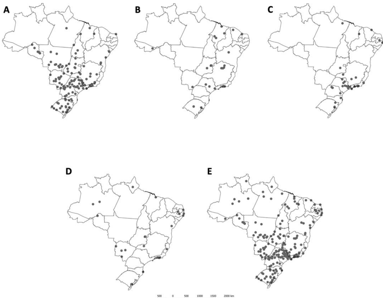
Figure 2. Distribution of Cochliomyia hominivorax records in Brazil: cattle myiasis (A); pets, other livestock and wildlife myiasis (B); human myiasis (C); adult trapping (D); and overall species distribution (E). Records without host were considered to overall species distribution map.

*Records without host (n = 32) or state (n = 1) identification were not considered in the present analysis. The frequency is followed by number of records in this table.