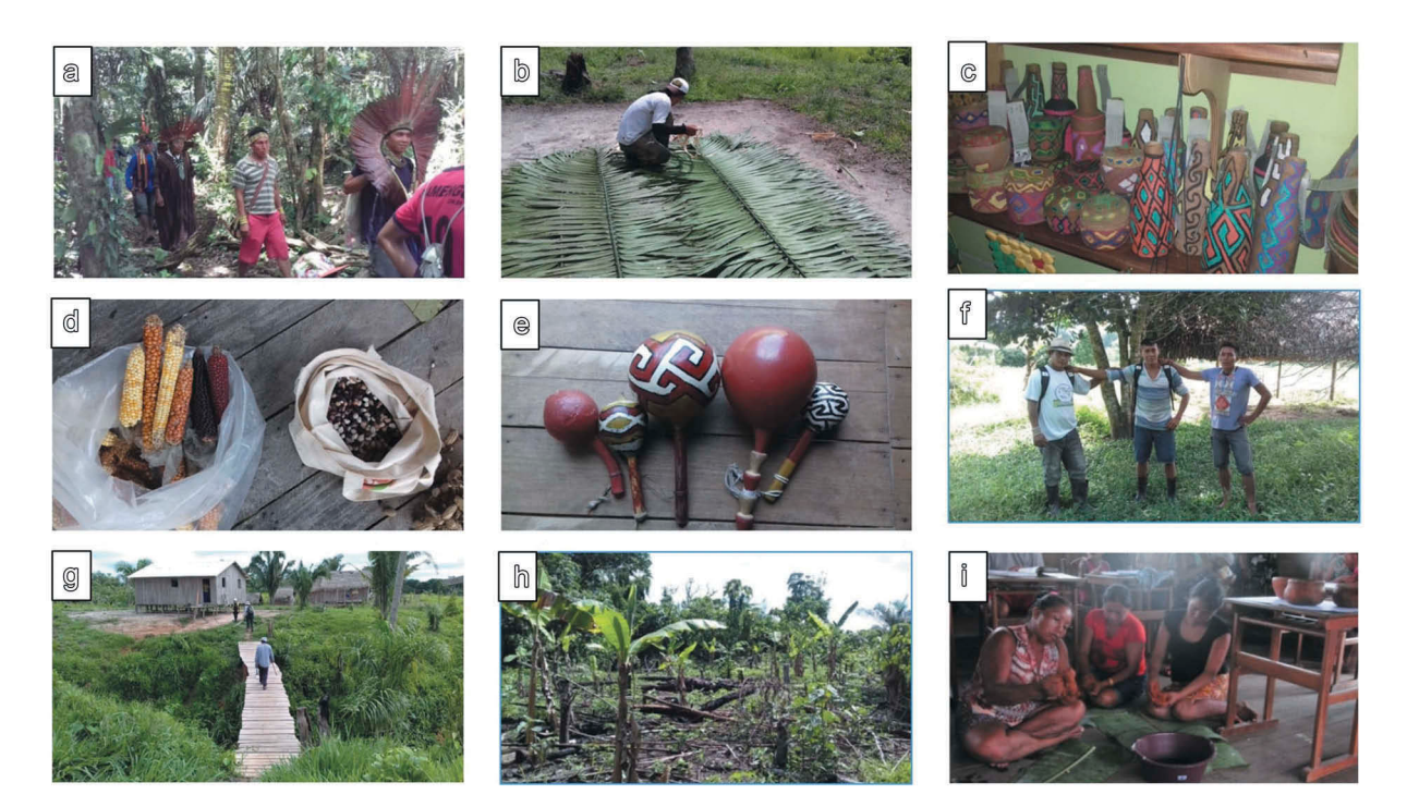
Figure 2. Examples of NCP and PCN identified by Kaxinawás: (a) feathers of birds used to produce 'cocares' (headdresses) that symbolize the Kaxinawá cultural identity and political hierarchy); (b) palm leaves used to produce a boat ceiling; (c) handicraft made of latex made with technology adapted from rubber-tapping introduced in the past of slavery; (d) agrobiodiversity of corn species associated with the Kaxinawá land use heritage; (e) (rattle) instruments produced with different wood and raw materials; (f) Kaxinawá knowledge agents (SISA officials) responsible for maintaining and supporting KNOIL in adapting the Kaxinawá knowledge legacy; (g) bridge and house made of wood; (h) shifting cultivation with banana and cassava; (i) ceramics produced by women using Kaxinawá spiritual rituals and knowledge.

referred to as intertwined with PCN and linked with each other. As such, forests are considered simultaneously as a pool of life; as identity; as homeland; as source of medicinal plants; and so on.