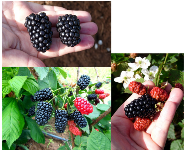
Figure 1. Fruits and flowers of cultivar BRS Cainguá.

The stem of BRS Cainguá is erect to semi-erect, with short internodes. It has fewer and smaller thorns than 'Tupy' or 'BRS Xingu'. The plants have low to medium vigor but are very productive. Leaves are light green with small