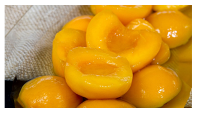
Figure 3. Peach halves in syrup, of cultivar BRS Jaspe.