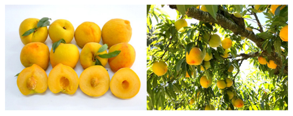
Figure 2. Fruits of 'BRS Jaspe'.