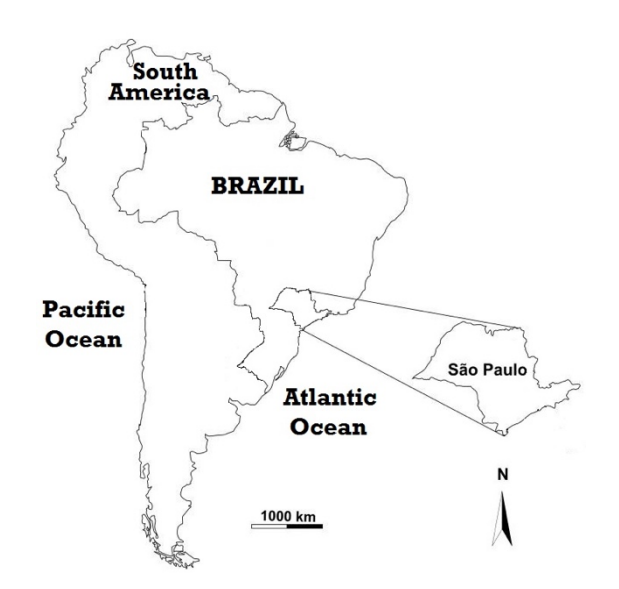
Figure 1. South America map, with the localization of Brazil and inside this the São Paulo State

MAPS – To facilitate the localization of the data collection points, following maps were constructed: